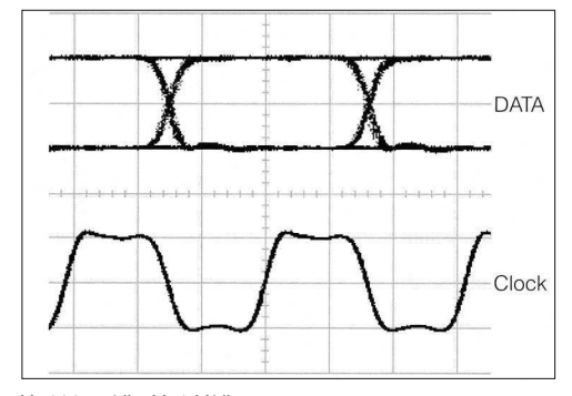
H: 100 ps/div, V: 1 V/div MU163220A output waveform (3.2 GHz)

Programmable patterns of 8 Mb max, PRBS patterns [(2^7 - 1)] to (2^{31} - 1) , variable mark ratio], and zero substitution patterns can be generated. Moreover, variable cross-point of data output waveform is also supported.